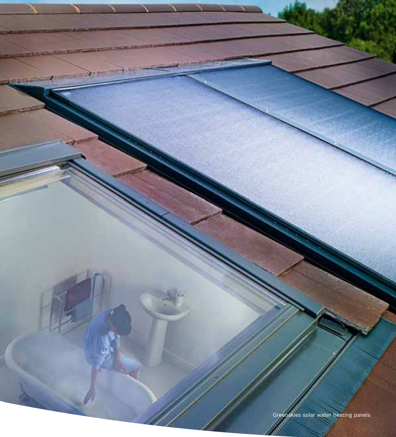
Greenskies solar water heating panels