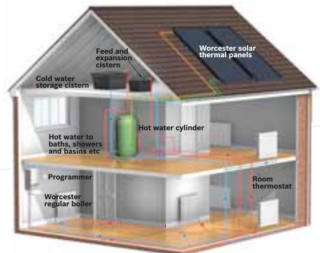
Regular boiler layout and solar water heating system