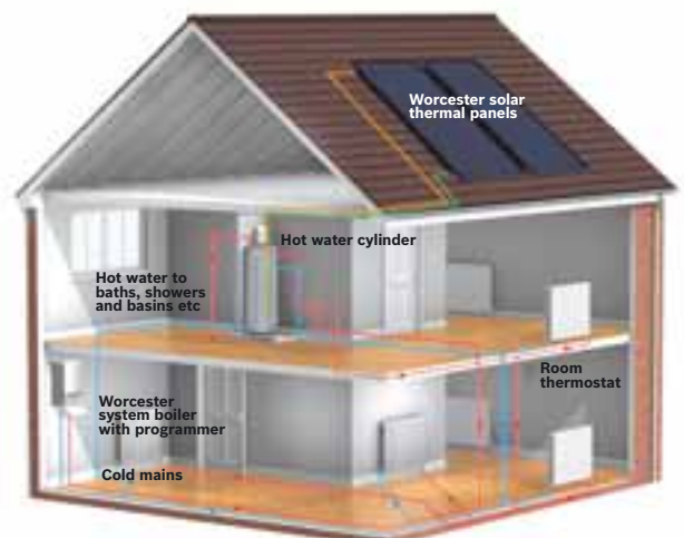
System boiler layout and solar water heating system (System boiler with unvented hot water cylinder)

Drawings are for illustrative purposes only